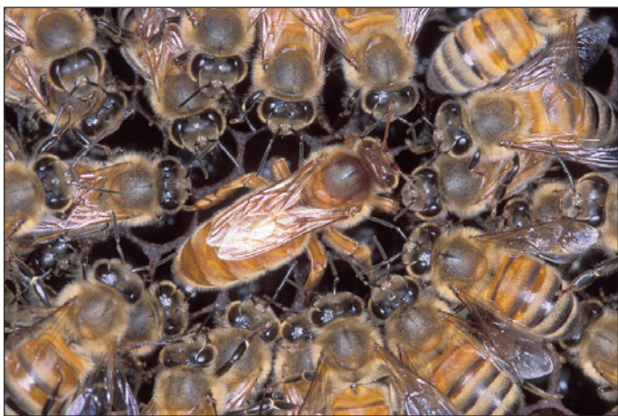
Honey bee workers surround a queen bee. Bees are likely to sting only when they perceive a threat to the nest and queen.