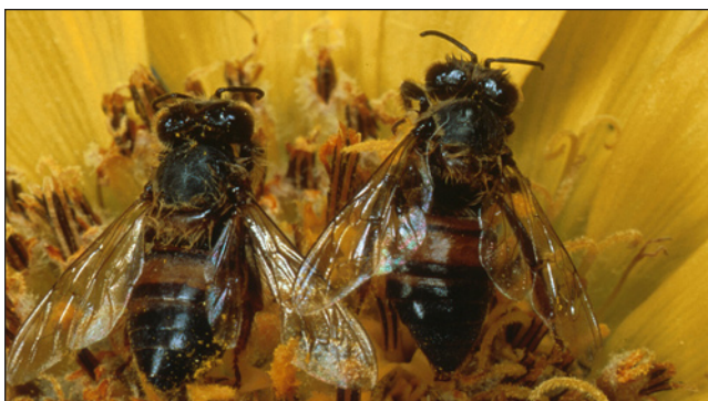
An Africanized honey bee (left) and a European honey bee. Despite size differences in these two individuals, the two strains cannot be distinguished visually.