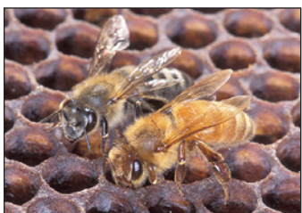
An Africanized honey bee (left) and a European honey bee on a honey comb. Despite color differences in these two individuals, the two strains cannot be distinguished visually.

Once away from the attack, remove the stingers as soon as possible. Stingers should be scraped out with a fingernail, knife or some other sharp object. Stingers continue to inject venom for many minutes after the initial sting. The sooner a stinger is removed, the less venom will be injected. If you