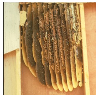
Bees can construct large wax nests rapidly once they enter a home. For this reason, both bees and nests should be removed as soon as possible.

Social wasps are quick to sting when defending their nests. Their attacks can be severe because they cooperate to defend the nest and because individual wasps can sting repeatedly. Honey bees can sting only once. Texas Cooperative Extension publication L-1828, Paper Wasps, Yellowjackets and Solitary Wasps , provides more information on wasps.