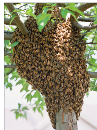
A honey bee swarm.

Because swarms do not have a nest to defend and the bees in the swarm are often full of honey, swarming bees are usually more docile than established colonies and less likely to sting. However, there is always a risk when working around bees. Therefore, Texas Cooperative Extension recommends that you contact a pest control professional to manage a swarm.