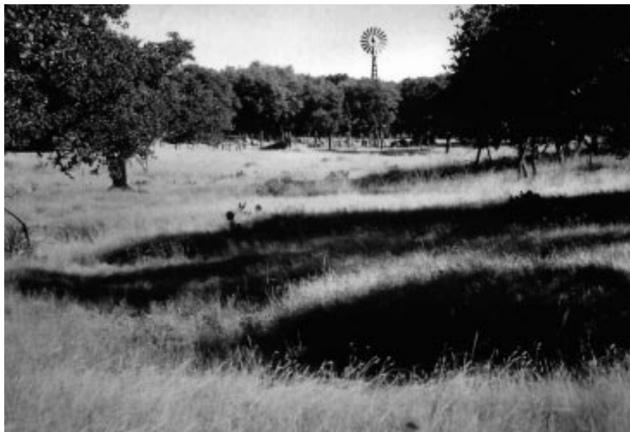
Figure 2. "Hiring" a good lessee who manages your property to meet your needs produces a stable range resource. A good lease is a viable opportunity for the lessor and the lessee.

management plan for the use of the property (Figure 2). This plan should reflect the goals of the landowner as well as the tenant and should include an initial inventory of resources. The resources available as well as the goals of each party must be understood if a proper lease is to be developed.